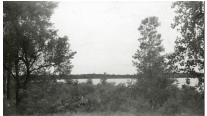
The shoreline at Memorial Beach prior to being cleared, 1946