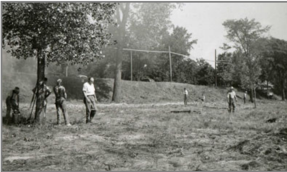
The nearly cleared beach showing the bank coming down from Lake Avenue above, 1946