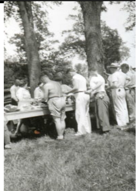
Volunteers break for a picnic lunch, 1946

In 2000 the City Council took action and reinstated the name Memorial Beach to again honor our veterans. From 2007-09 improvements along Lake Avenue, including enhancements such as historic markers along the trail that runs parallel to the street, and a renovation of the beach have improved the area and upgraded the trail system that runs all the way to Lion's Park near the White Bear Shopping Center.