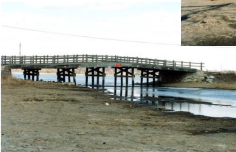
MANITOU ISLAND BRIDGE, 1989-1990