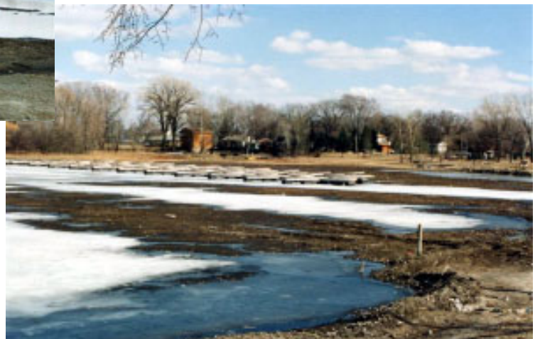
COTTAGE PARK, 1989-1990