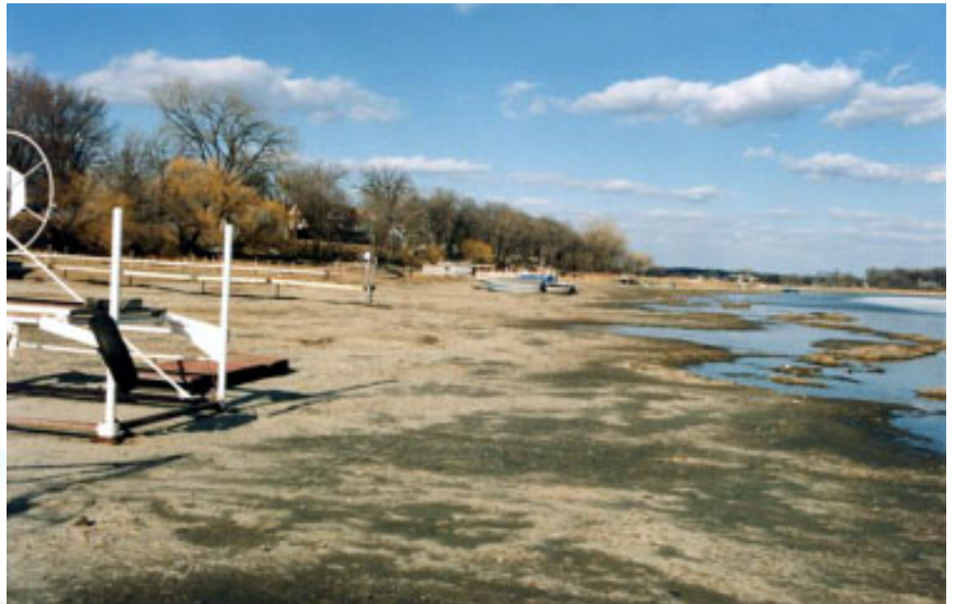
LAKE AVENUE, 1989-1990

Today people say White Bear Lake has never been lower and often question whether it is going to dry up completely. It's hard to envision, but the lake has been worse in years past. Let's hope it will once again rebound due in part to human efforts and in part to nature itself since it is the treasure that touches so much of our community.