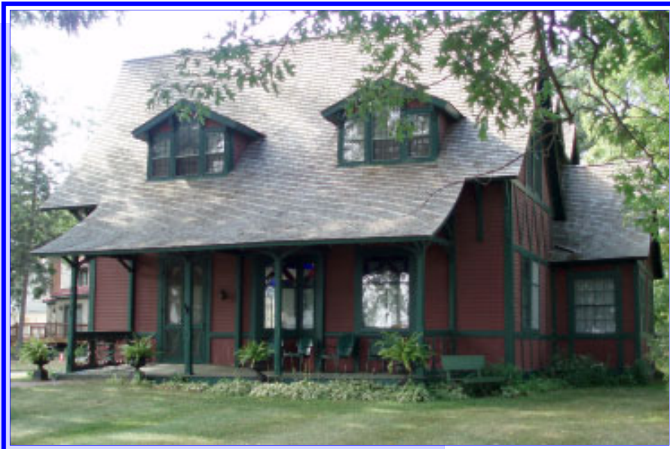
4735 LAKE AVENUE