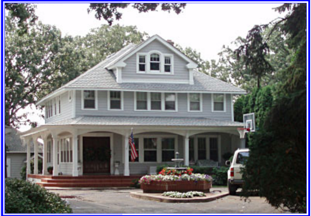
4560 LAKE AVENUE

“The Gateway to White Bear Lake” - occupying prime lakefront property this home was built in 1920 in the heart of what had just previously been the resort district of White Bear Lake. Situated directly along Highway 1 which was the name given to today’s Highway 61 as it made its route along Lake Avenue and out Stewart Avenue to the north end of town, this property witnessed the changes ushered in by the end of the resort era and the focus on future development.