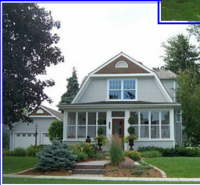
2256 FOURTH STREET