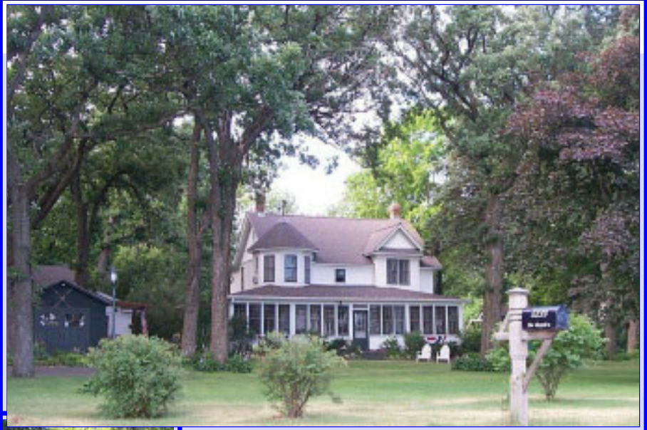
5223 WEST BALD EAGLE BOULEVARD

Bald Eagle Lake has served as a resort area in its own right for over a century. Remarkably, many of the summer homes and cottages in this area have remained within the same families and have transferred through the generations. Nearly all of the original cottages and resorts had names such as “Hill Top” or “Spring Park Villa” often describing their physical characteristics.