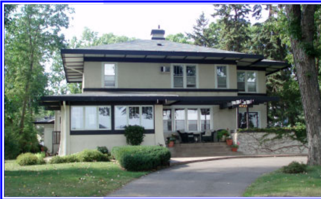
4753 LAKE AVENUE