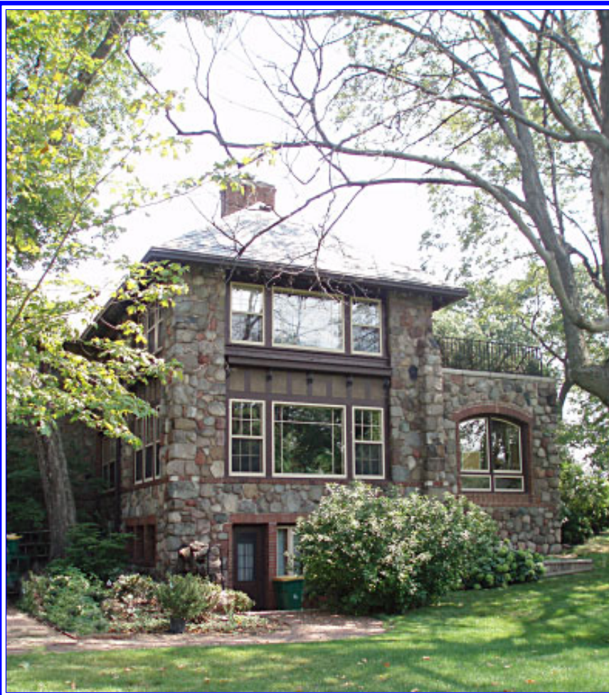
54 PENINSULA ROAD