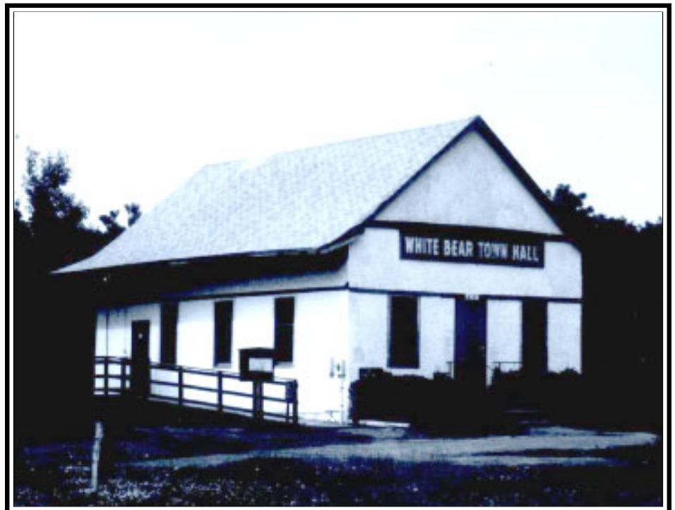
WHITE BEAR TOWN HALL IN ITS CURRENT SITE, 2004

The building is slated to be moved to its fourth and hopefully final location this fall. The White Bear Lake Area Historical Society will continue to assist White Bear Township with this project as it progresses.