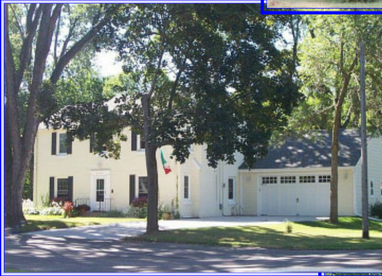
2292 SIXTH STREET