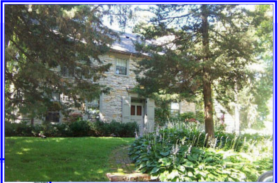
2504 MANITOU ISLAND

One of the last lots to originally be developed on Manitou Island the home at 2504 was designed by noted local architect, Edwin Lundie and built in 1940 on this fabulously wooded lot. Lundie, who resided in Mahtomedi for a time, favored designing homes that complemented the natural surroundings.