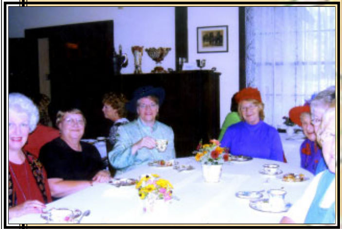
GUESTS ENJOY THE VICTORIAN TEA, 2006